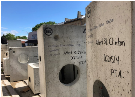
Catch basins for Albert Street